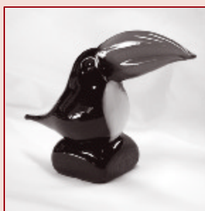
Glass Bird, maker unknown Gallery on the Plaza, Babbidge Library

Glass has been used for thousands of years to create decorative, functional, and sculptural objects. In Europe and North America for much of the 19 th and 20 th centuries, glass pieces were produced in factories. However, new discoveries during the second half of the 20 th century made it possible for artisans to create glass items in individual or small-group studios. This exhibit displays selected works from both factories and studios.