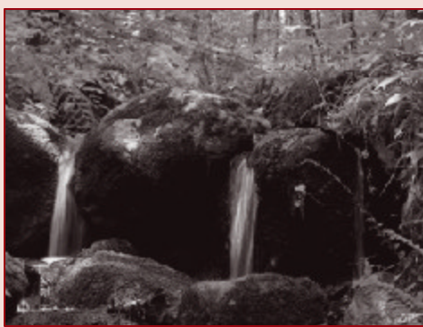
Waterfall, Arcadia Management Area, Arcadia, RI Stevens Gallery, Homer Babbidge Library