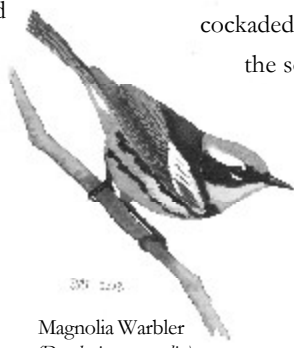
Magnolia Warbler ( Dendroica magnolia )