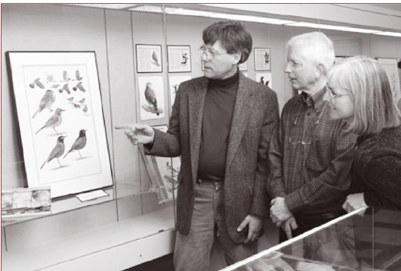
Prior to his lecture, which was sponsored by UConn’s Center for Conservation and Biodiversity, the Connecticut Audubon Society, and the Natchaug Ornithological Society, Sibley described some of the techniques used in his paintings exhibited in the Dodd Center Gallery to members of the audience.