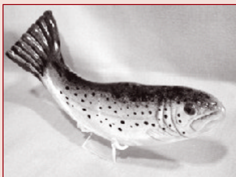
Glass Trout by Kenneth Carder

Glass has been used for thousands of years to create decorative, functional, and sculptural objects. In Europe and North America for much of the 19 th and 20 th centuries, glass pieces were produced in factories. However, new discoveries during the second half of the 20 th century made it possible for artisans to create glass items in individual or small-group studios. This exhibit displays selected works from both factories and studios.