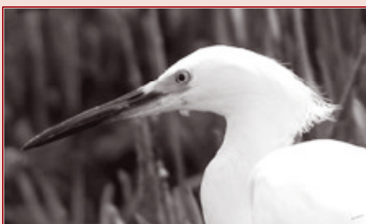
Snowy Egret, Great Island, East Lyme, CT