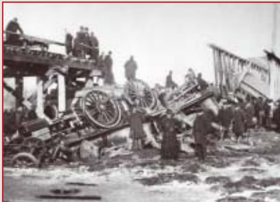
Dodd Research Center Gallery

Crashes, Calamities & Catastrophes in Connecticut