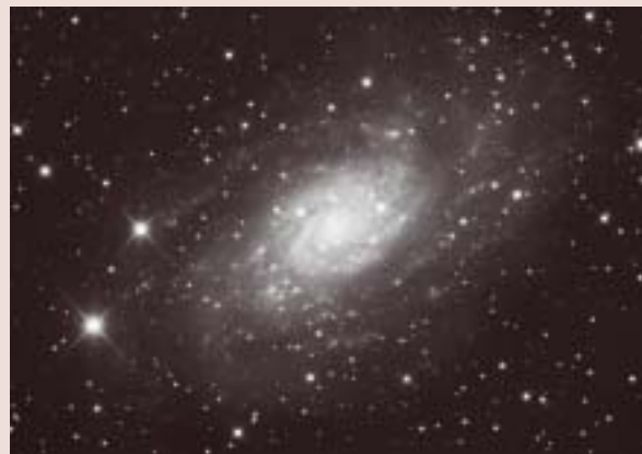
Babbidge Library, Stevens Gallery