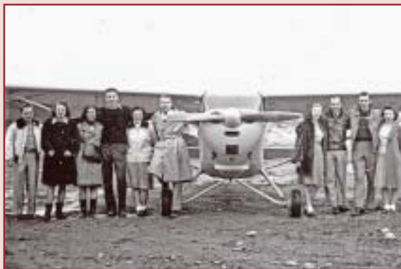
Dodd Research Center, West Corridor