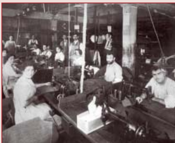
Babbidge Library, Plaza Level, West Alcove