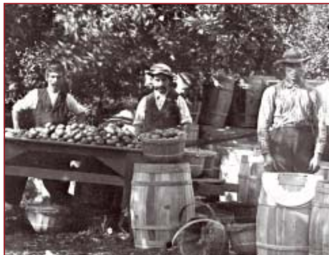
Orchards, n.d.

Blogging has become a popular and efficient way of keeping people informed, varying from personal blogs to professional business blogs. In addition to highlighting gems in the Dodd Center's collections, the blog will also publicize lectures, special events, and make other announcements.