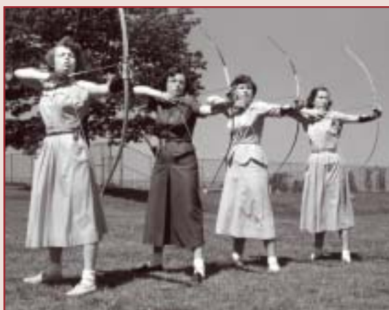
Babbidge Library, Gallery on the Plaza